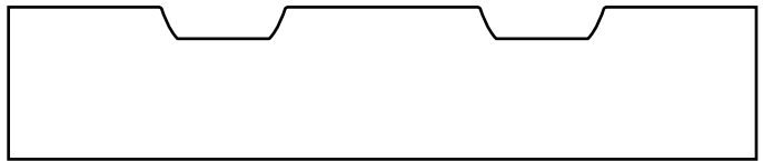
2" (50.8mm) Section Profile

Short Sheet Dim.: 98.42" (2500mm) X 49.21" (1250mm)